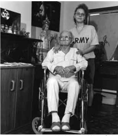
1992 Lower West Side

The teacher uses the Lower West Side (Triptychs and Quartets) photographs to discuss and write about how a neighborhood functions, changes over time in family relationships, or growing up in their own neighborhood. The teacher provides literature about coming of age and urban neighborhoods and students select the books they read.