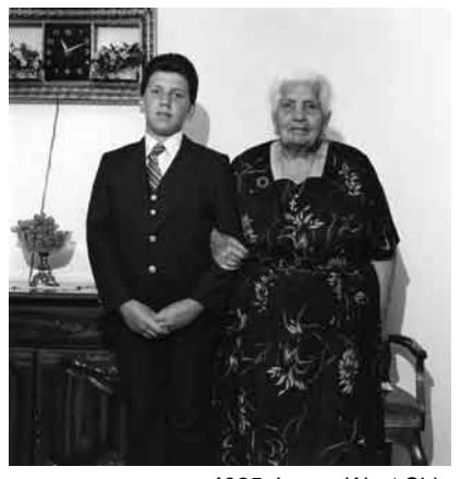
1985 Lower West Side