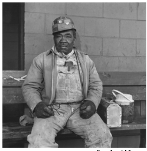
Family of Miners

The photographs are to be used in conjunction with other materials (e.g., primary source readings, texts, literature, music, films.) See "Methods for Teaching with Photographs" in this Teaching Guide. See also The Power in Their Hands (in "Teaching Resources") for a detailed curriculum, primary sources, activities and role plays for teaching U.S. labor history.