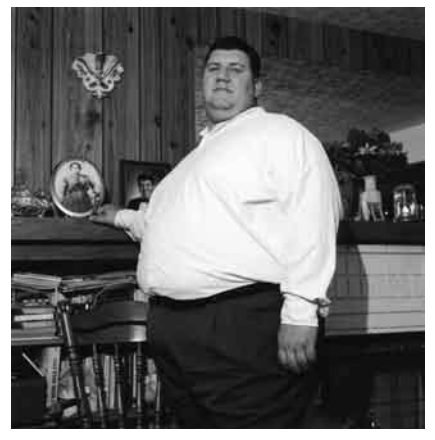
2001 Lower West Side