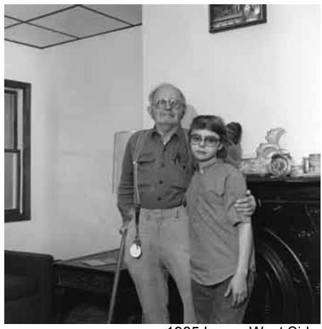
1985 Lower West Side