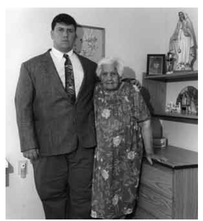
1992 Lower West Side